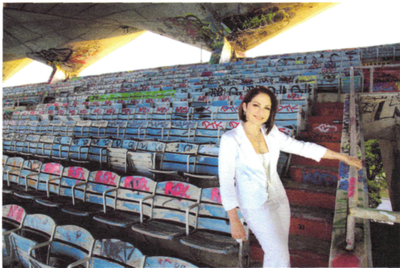
Gloria Estefan at Miami Marine Stadium

Friends of Miami Marine Stadium and the National Trust for Historic Preservation are pleased to announce that Gloria Estefan, a Grammy winning crossover artist and leading Miami businesswoman, will take a prominent role in the ongoing advocacy campaign to restore the iconic stadium as a centerpiece of cultural life in Miami. Estefan, a Trustee of the