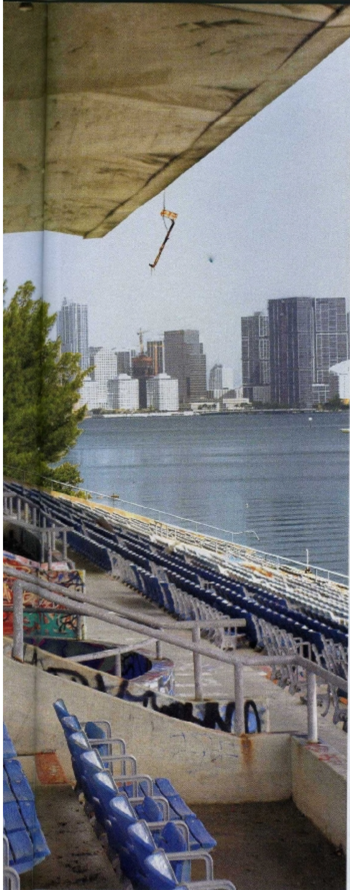
TROY CAMPBELL; SPILLIS CANDELA (MIAMI ARCH-IVES)