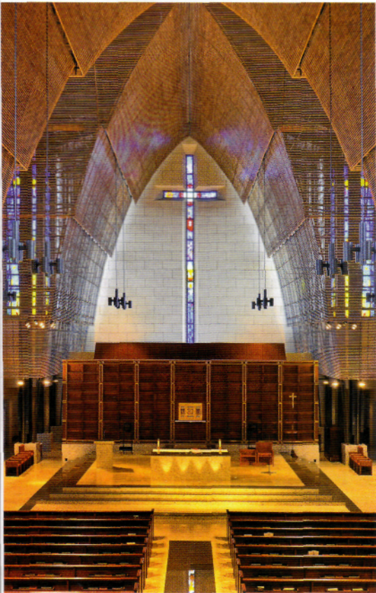
Church of the Epiphany, designed by Candela, 1994-1997, completed in 2000.