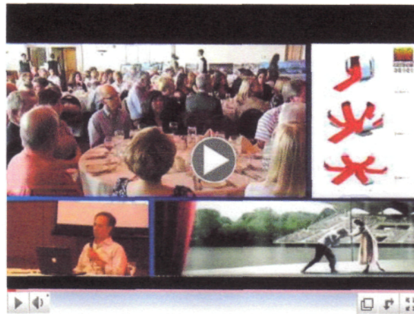
City of Miami - Miami Marine Stadium Floating Stage Competition

# of stories submitted to IF SEATS COULD TALK .....122