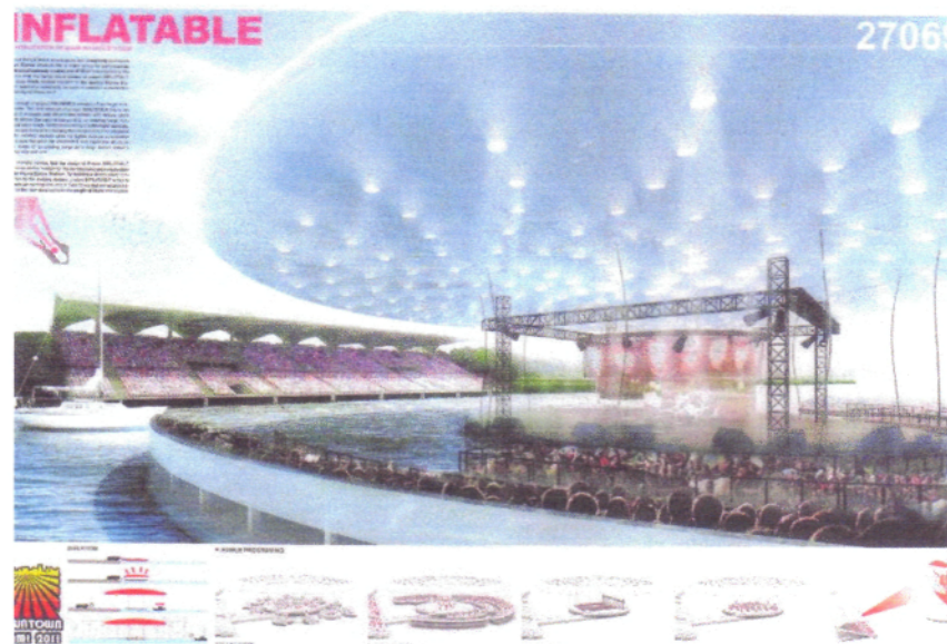
DK Design Group, Copenhagen, Denmark

In 2011, Friends of Miami Marine Stadium collaborated with DawnTown , to create a design contest for a new floating stage for the Miami Marine Stadium. Administered by Dawntown and co-sponsored by the National Trust For Historic Preservation, the Miami Chapter of the American Institute of Architects and Dade Heritage Trust, this "ideas" contest was a great success-attracting over 90 entries from all over the world and lots of press.