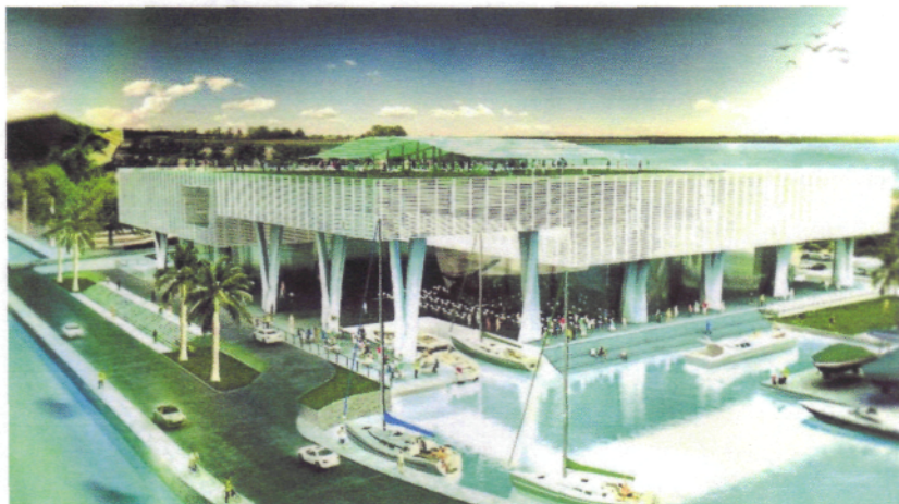
Proposed Marine Stadium Maritime Center