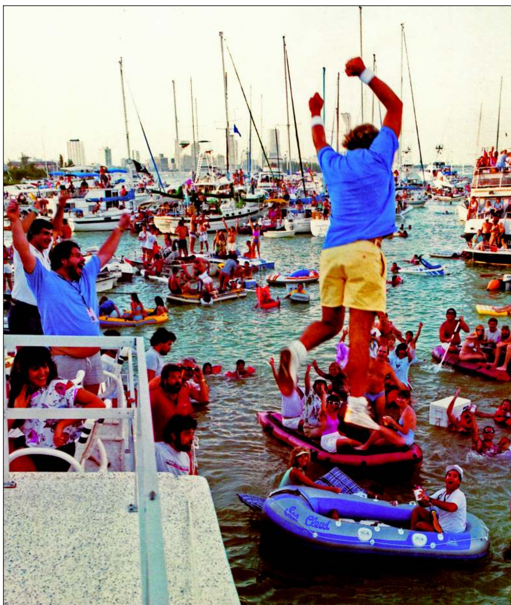
TAKING THE PLUNGE: Jimmy Buffett leaps into the water from the floating stage after completing a show at the Miami Marine Stadium, shown below.