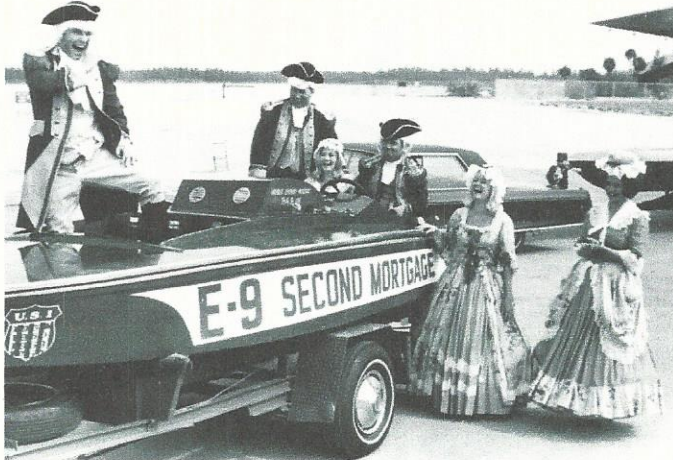
George Washington Regatta, 1968