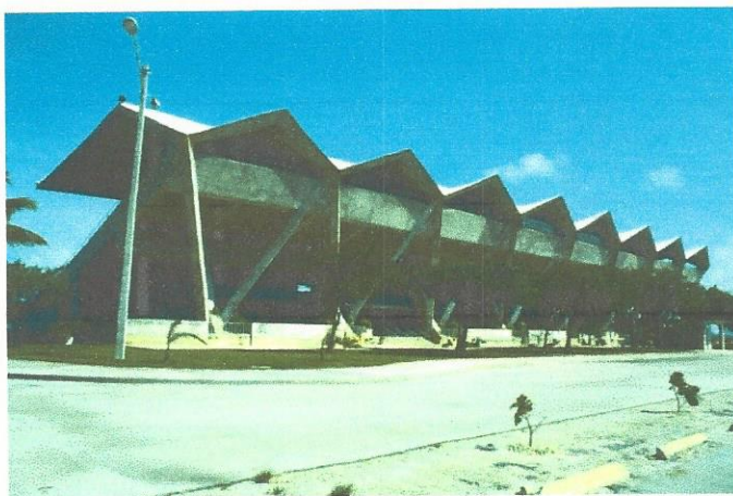
Historic Photo of Miami Marine Stadium